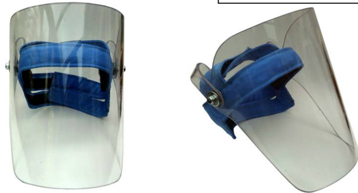
Creative trimming has reduced weight and helped to increase stability and comfort.