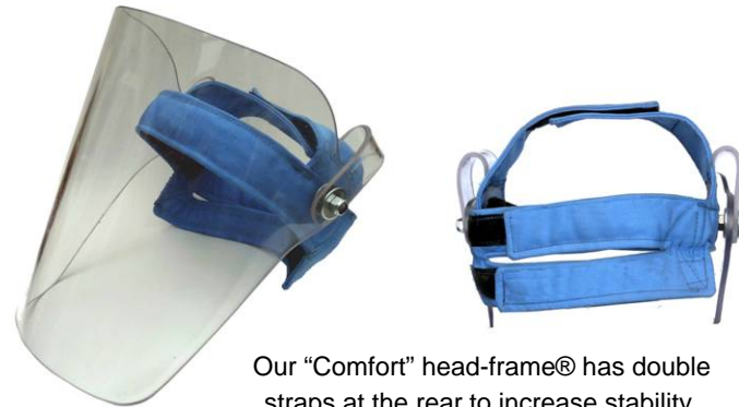
Our "Comfort" head-frame® has double straps at the rear to increase stability.