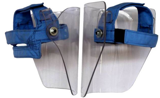
The Platinum visor alongside the traditional full-face visor.